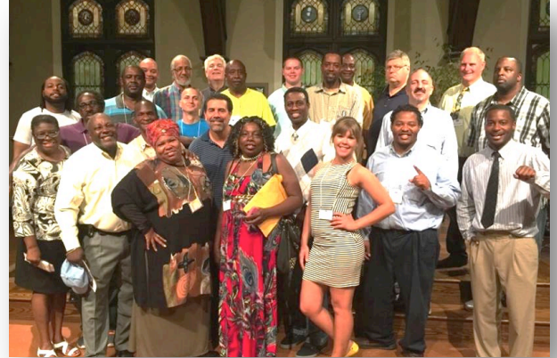
WISDOM's first EXPO Fellowship commissioning.